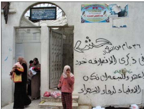
Shija'ia Family Health Centre, January 2004