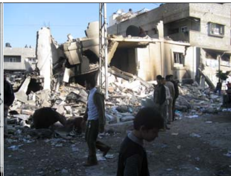
Shija'ia Family Health Centre, January 2009