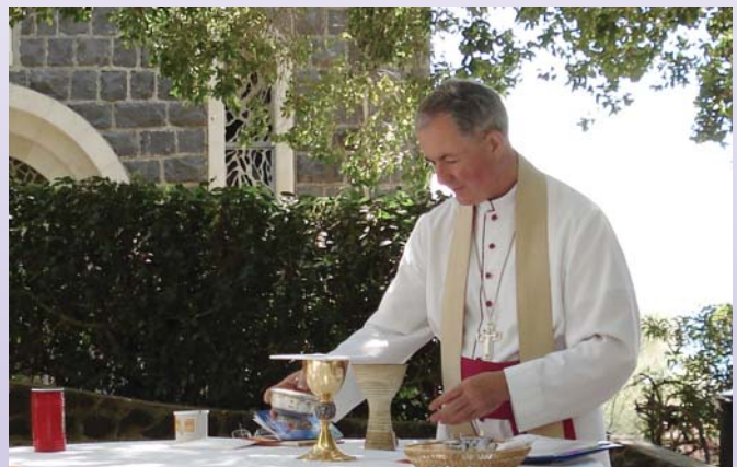
Celebrating the Eucharist beside the Sea of Galilee

Your diocesan website www.monmouthdiocese.org.uk