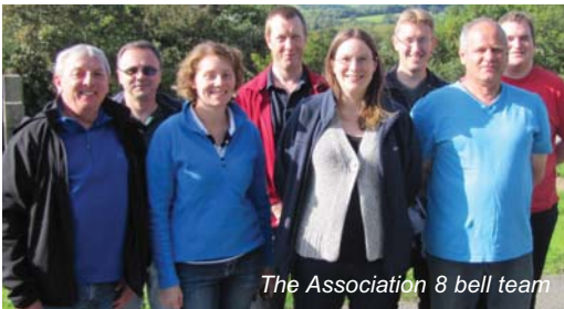
The Association 8 bell team

The Association had a successful visit to the The All Wales Striking Competition on Saturday 25th September 2010. This was held at St Peter's, Glasbury-on-Wye. Glasbury bells, rehung in 1999, are a very pleasant ring and it quickly became obvious that competition would be tight.