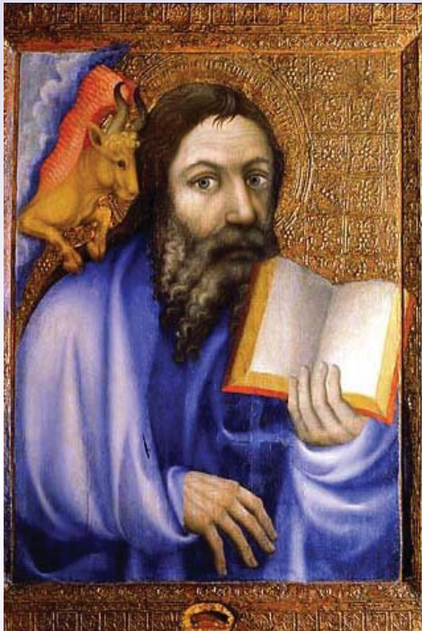
St. Luke by Master Theodoric, 1360

Firstly , I want to invite you to join with me on five evenings this Lent in an exploration of St Luke's Gospel. Two years ago during Lent, for five weeks I spoke on twenty five evenings at five different locations across the diocese on St John's Gospel and I was staggered and humbled by the extraordinary response. Some locations had standing room only, and over eight hundred people took part. I dare to hope that my invitation will get a similar response this year.