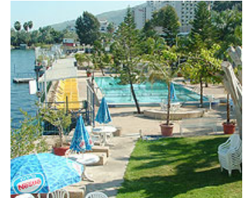
Ron Beach beside the lake

We have included most expenses in the tour cost but some items are listed separately. The travel insurance premium is £49. Everybody travelling should be insured but some may have annual or another suitable insurance. You should budget for an amount of £40 per person for a group gratuity fund which we will disburse locally to those who help us on our journey. Single rooms are available at a supplementary cost of £245. Please, however, see our note "Travelling Alone" overleaf. The optional excursion to Masada and the Dead Sea costs £45. Any special requests should be noted on the booking form. A deposit is payable now with the balance payable 8 weeks prior to departure.