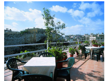
Golden Walls Hotel Terrace

The cost of this tour is £1,290 sharing a twin-bedded room with private facilities. We stay in two family owned and managed hotels. In Jerusalem, the three star Golden Walls Hotel overlooks the Old City walls and is walking distance of the Holy Sepulchre. In Tiberias, we stay at the four star Ron Beach Hotel in a wonderful situation right on the lakeside. The tour is on a full-board basis with buffet breakfast, lunch and table d'hôte evening meal included daily. Touring is in air-conditioned coaches and we will be accompanied by a local guide who will share leadership responsibilities and look after the formalities of hotel check-ins etc. All entrance fees are included. Flights are with EL AL Israel Airlines between London Heathrow and Tel Aviv. All airport and security charges are included and a complimentary visa is issued on arrival in Israel.