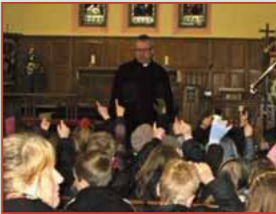
Children from Cornist Park School on a visit to the Parish Church in Flint.