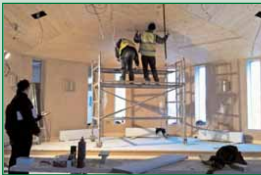
Worship area in progress