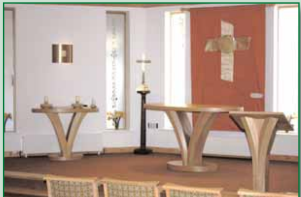
Worship area completed

On top of money raised locally, grants also came from the Big Lottery People and Places Fund, the Welsh Assembly's Community Activities and Facilities Programme, WREN, Conwy Council and other grant making bodies.