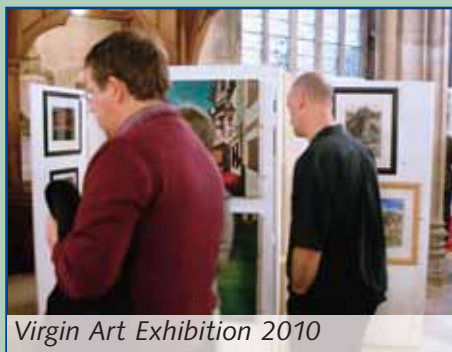
Virgin Art Exhibition 2010

Anybody interested can find details and entry forms on the website: