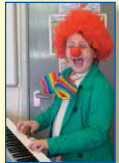
St George Primary in Abergele on Comic Relief – a pupil uses the keyboard the Trust helped to fund

In the climate of ever-tightening school budgets, the Trust is there to help towards the cost of materials and projects – except staff costs – which help schools to resource excellence in Religious Education and Worship in all Schools, and more good news is that an increasing number of schools